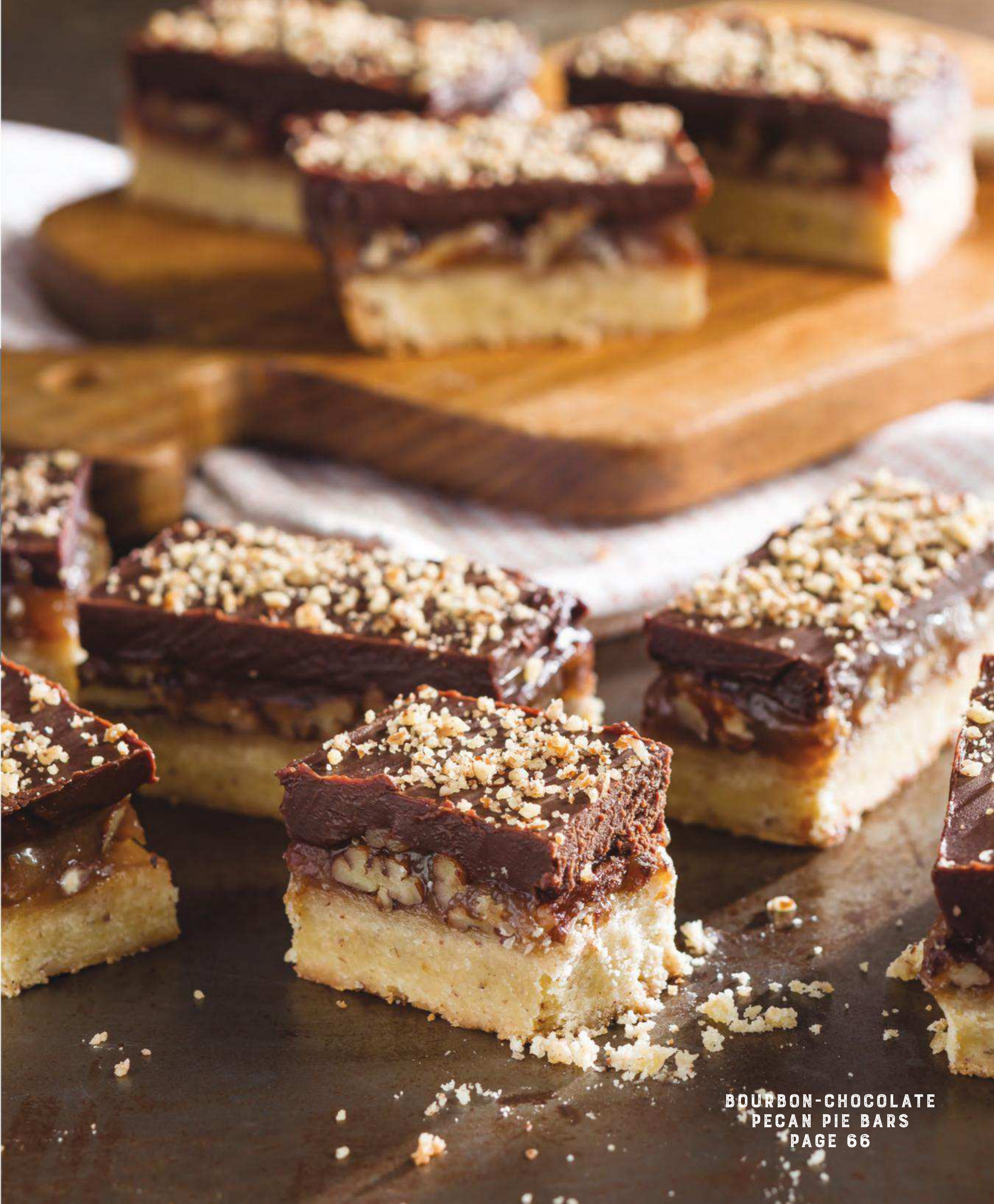
BOURBON-CHOCOLATE PECAN PIE BARS PAGE 66