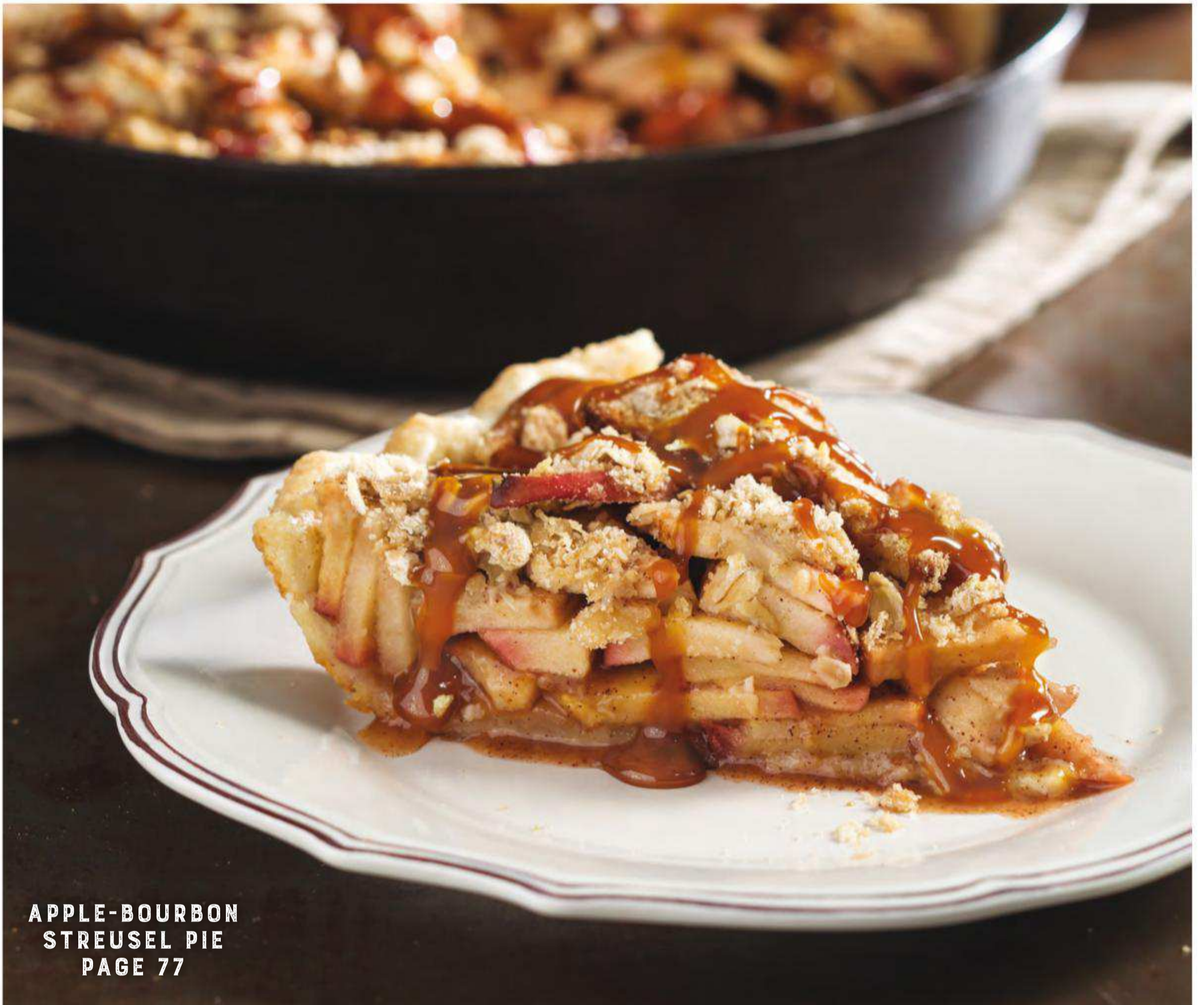
APPLE-BOURBON STREUSEL PIE PAGE 77