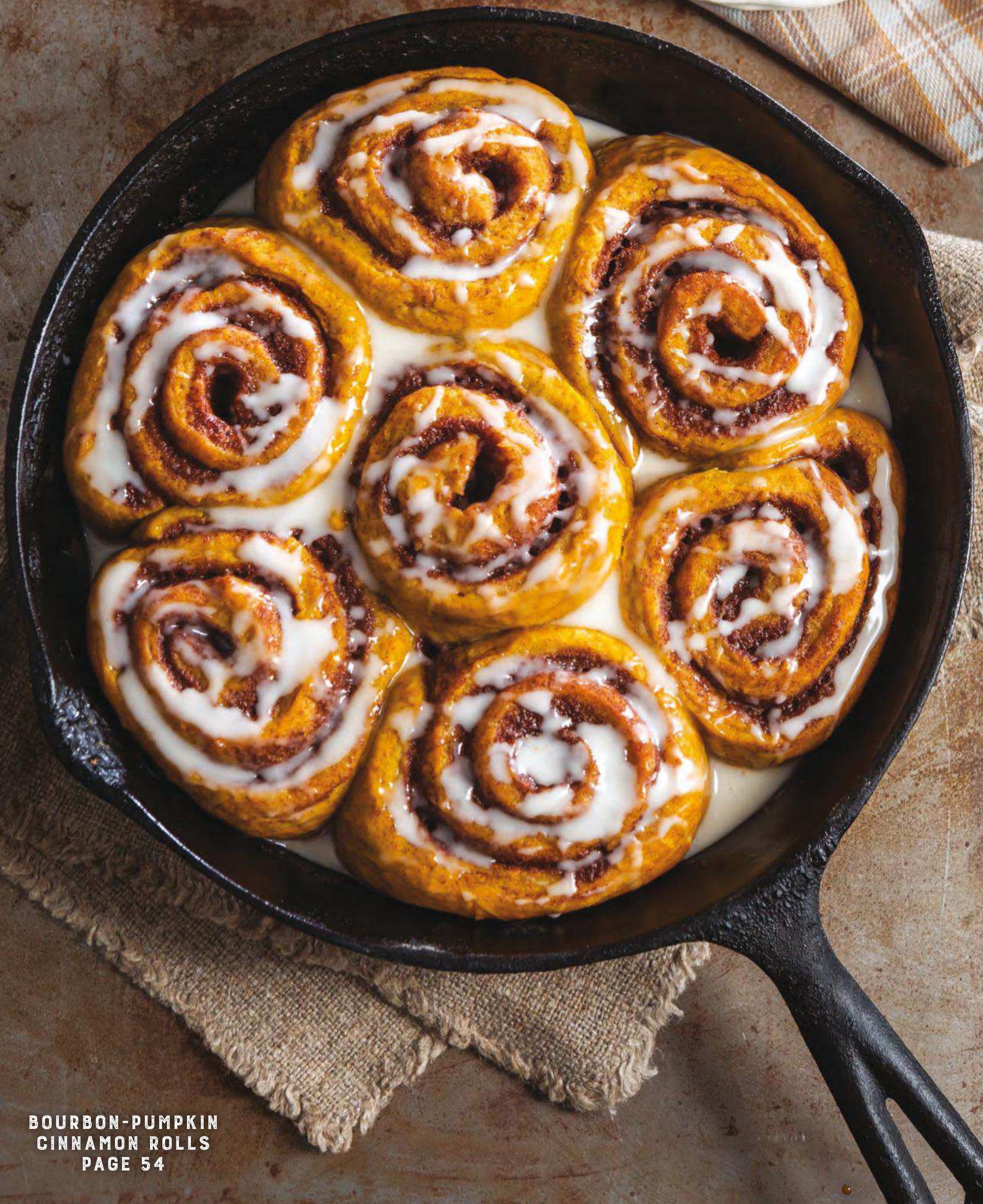
BOURBON-PUMPKIN CINNAMON ROLLS PAGE 54